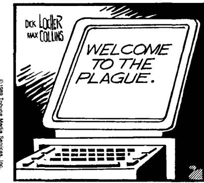
Reprinted with permission: Tribune Media Services.